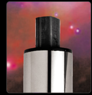
1 inch DD shaft.