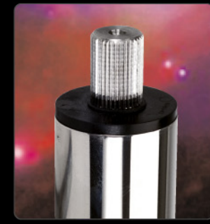
3/4-36 splined shaft.