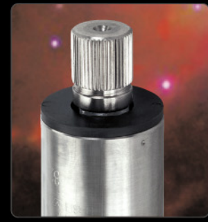
1 inch-48 splined shaft.